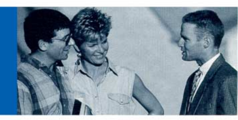
HOUSING AFFORDABILITY AND FINANCE SERIES